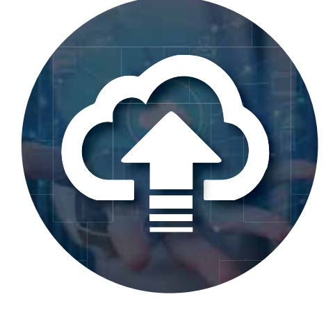
Cloud Computing, Cloud Migration